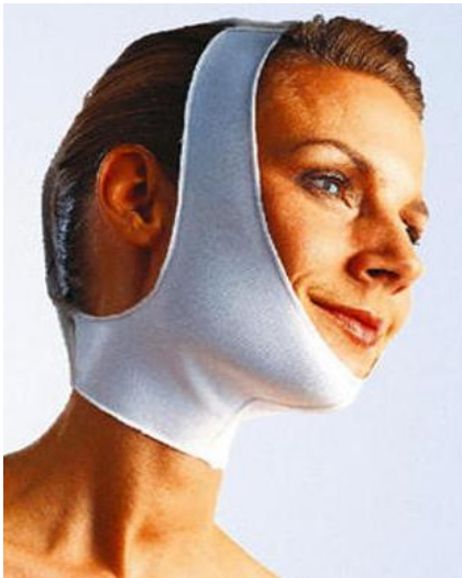
Compression Bandage for Face