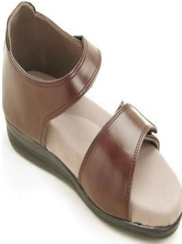
Diabetic Sandles / Chappals