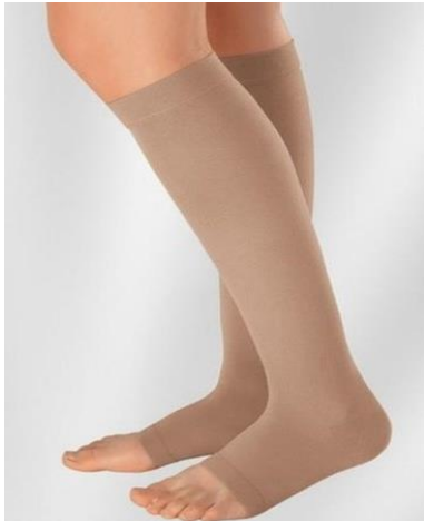
Varicose Veins Stocking